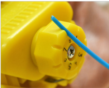
Built-in sizing channels determine proper setting for buffer tubes.