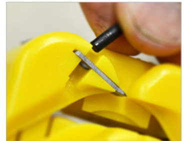
Fixed stainless steel blades require no adjustments and replace easily.

For more information or to locate the nearest authorized Ripley® distributor, please visit www.ripley-tools.com or call 1 (800) 528-8665 to speak to a customer service representative.