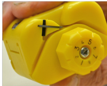
Spring-loaded design eliminates need to lock or clamp tool while in use.