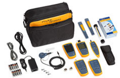
FKT1475 Complete Fiber Verification Kit